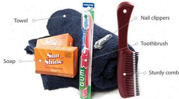
PERSONAL CARE KITS

Help us assemble Personal Care Kits for Lutheran World Relief.