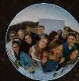
WAVES WORSHIP University Ministry

SATURDAY, SEPTEMBER 13, 2025 5 PM | MALIBU CAMPUS