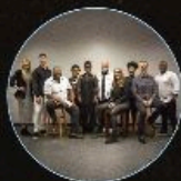
United Voice Worship Music Ministry